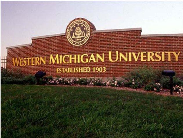
East Campus entrance at Oliver Street Western Michigan University