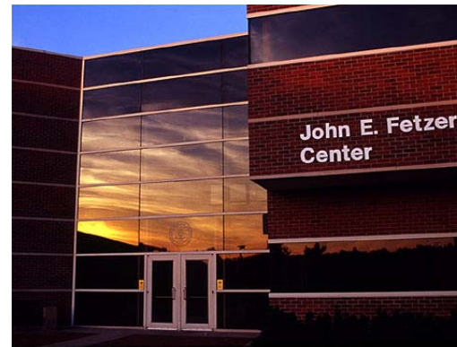
John E. Fetzer Center Western Michigan University