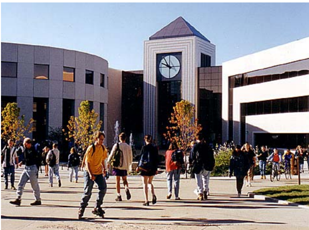
Waldo Library, Stewart Tower and University Computer Center Western Michigan University