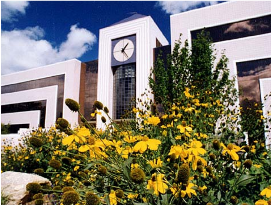
'Brown and Gold' brown-eyed Susans near Stewart Tower Western Michigan University