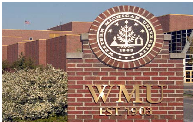
West Campus entrance at Oliver Street and Student Recreation Center Western Michigan University